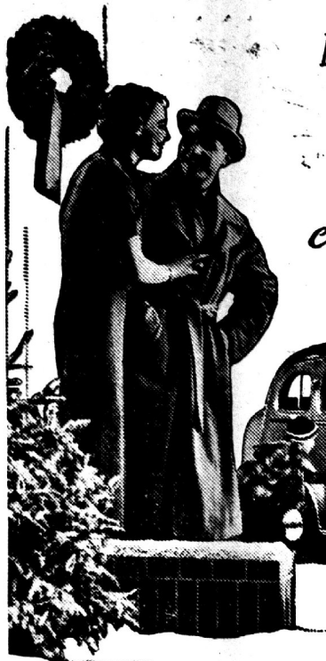
MASTER DE LUXE SPORT SEDAN

Make their Christmas joy complete with the only complete low-priced car