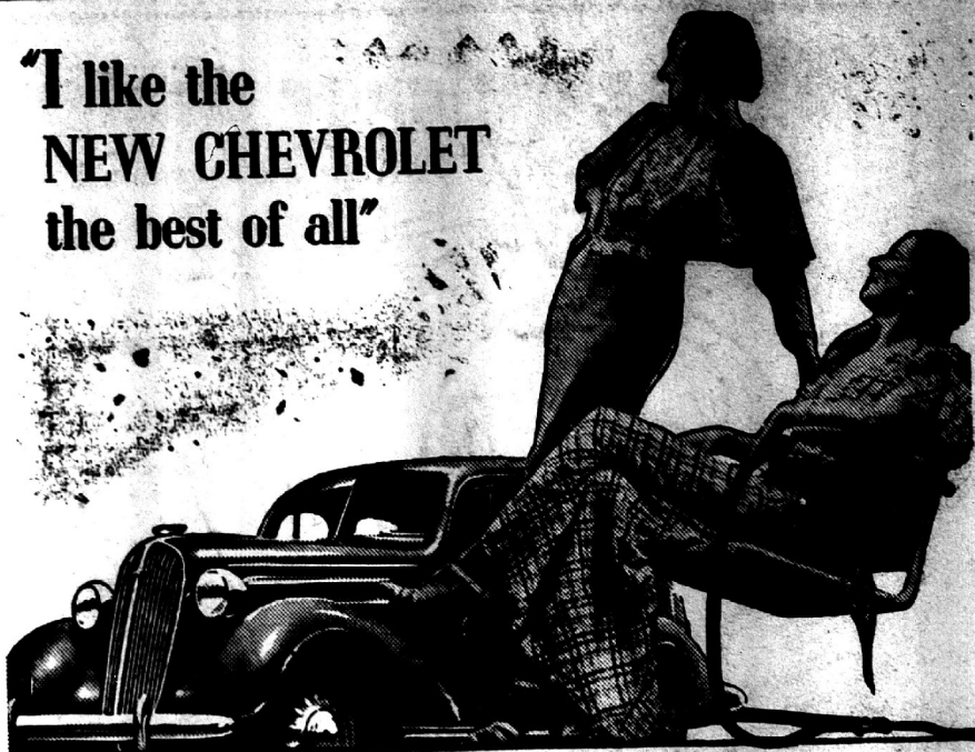
MASTER DE LUXE SPORT SEDAN

"I like the NEW CHEVROLET the best of all"