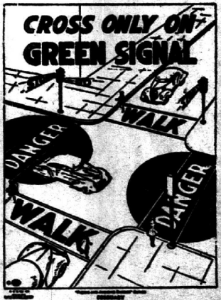
Issued by CHICAGO MOTOR CLUB